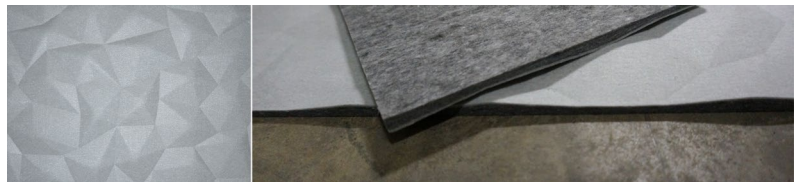
Detail of front, side and back of Panel