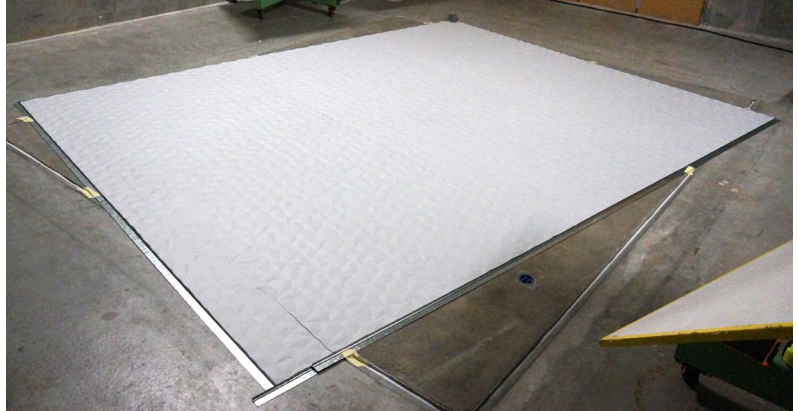
Test specimen installed for testing